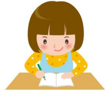
finished my homework