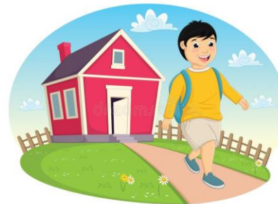
left my house