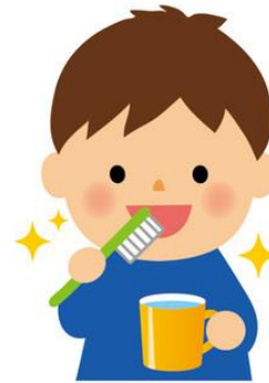
brushed my teeth