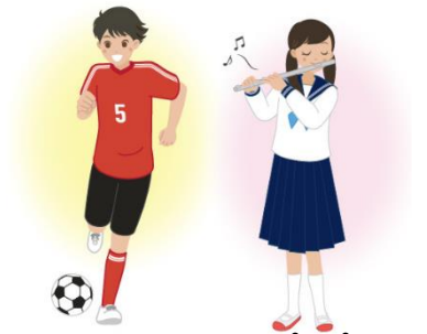
gone to club activities