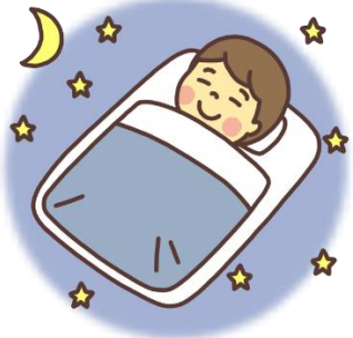
gone to bed